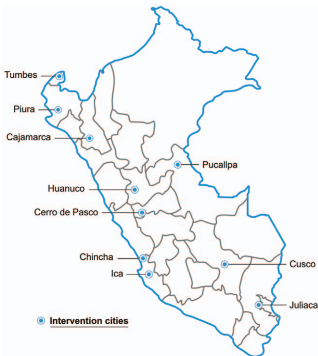
Figure 1. Map of Peru with the location of the 10 intervention cities (each city has more than 50,000 inhabitants). doi:10.1371/journal.pone.0019318.g001

The training was evaluated through comparing pre-test knowledge with post-tests knowledge. The pre-test, post-test of knowledge and follow-up tests were the same, but the question order was altered. The test was structured with 22 questions and vignettes, each with one correct answer. Five additional questions about self-reported practices were included in the pre-test and follow-up test. The areas queried were frequency of use of algorithms for syndromic management of patients with STDs, use